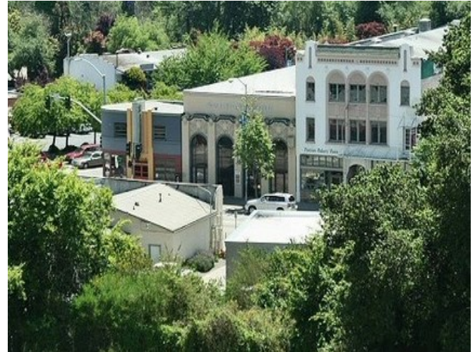
Soquel Village.

According to the U.S. Census, twice as many workers commute out of the County as commute in, and commute times are increasing. Higher-income residents tend to work over the hill, and there are few job opportunities within the County for these residents. On the flip side, workers in existing lower-wage jobs in Santa Cruz County are finding it more and more difficult to afford to live here. To improve the jobs/housing balance, the County is planning to accommodate strategic job growth in industries such as health care and technology, while simultaneously enabling more housing options for workers in existing industries such as agriculture and tourism.