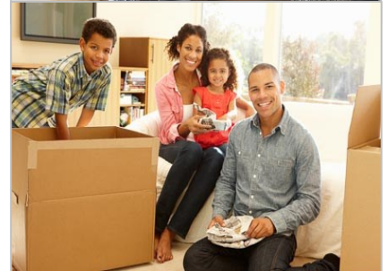
Top photo: https://www.flickr.com/ Middle photo: https://www.pikrepo.com/ Bottom photo: https://pansykemprealty.com/ Accessed June 12, 2020.