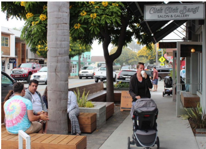
Outdoor seating on lower 41st Ave.