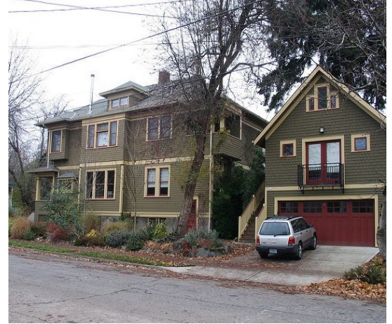
ADU over a garage provides infill development in an existing neighborhood.

The Sustainability Update promotes housing types such as accessory dwelling units (ADUs), small lot single family homes, dwelling groups, duplex/triplex/quadplexes, townhomes, and small apartment buildings, all of which can work well as “infill” development (new development within existing developed neighborhoods). These housing types are referred to as the “missing middle” because they have densities between those of single-family homes and apartment buildings. Infill development in single family neighborhoods adds population density to support a wider range of neighborhood businesses. Design guidelines will ensure that infill development is proportional in scale and size to the surrounding neighborhood.