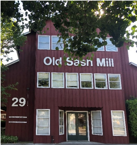
Multi-use Santa Cruz Sash Mill.

Small businesses are encouraged to grow in incubators, coworking spaces, and satellite offices. Broadband development is planned to accommodate traditional office growth as well as telecommuting. Home-based businesses that are compatible with residential neighborhoods serve to provide economic stability for property owners while adding to neighborhood land use diversity.